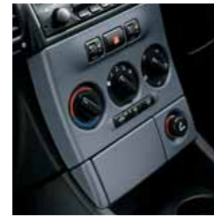
Charcoal metallic-effect centre console.

Yet stylish features like white sports instruments with chrome-effect edging, a leather-covered steering wheel and a host of great options, let you express your personality too. So you'll be as comfortable driving this Zafira to a business meeting as a fun night out with friends. Choose from a 1.6i 16v petrol engine or a 2.0DTi 16v diesel and get more out of life with Zafira Breeze.