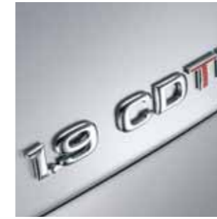
1.9CDTi 16v common rail diesel units.