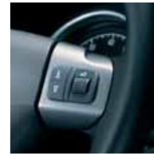
Steering wheel mounted audio controls.

Air-conditioning, 16-inch alloy wheels, a trip computer and a leather-covered steering wheel with audio controls are just a few of the standard features. And plenty more are available as options – either individually or as affordable option packs. Great choices. Great ways to make an impression. That's New Astra Breeze.