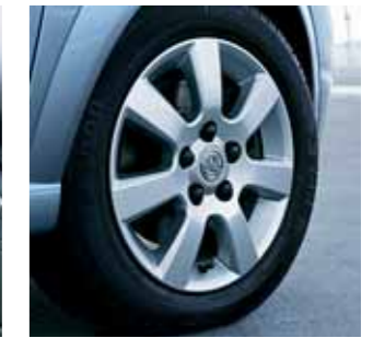
15-inch alloy wheels.