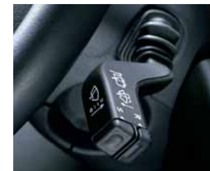
Trip computer controls (Trip computer is part of the optional Technical pack).