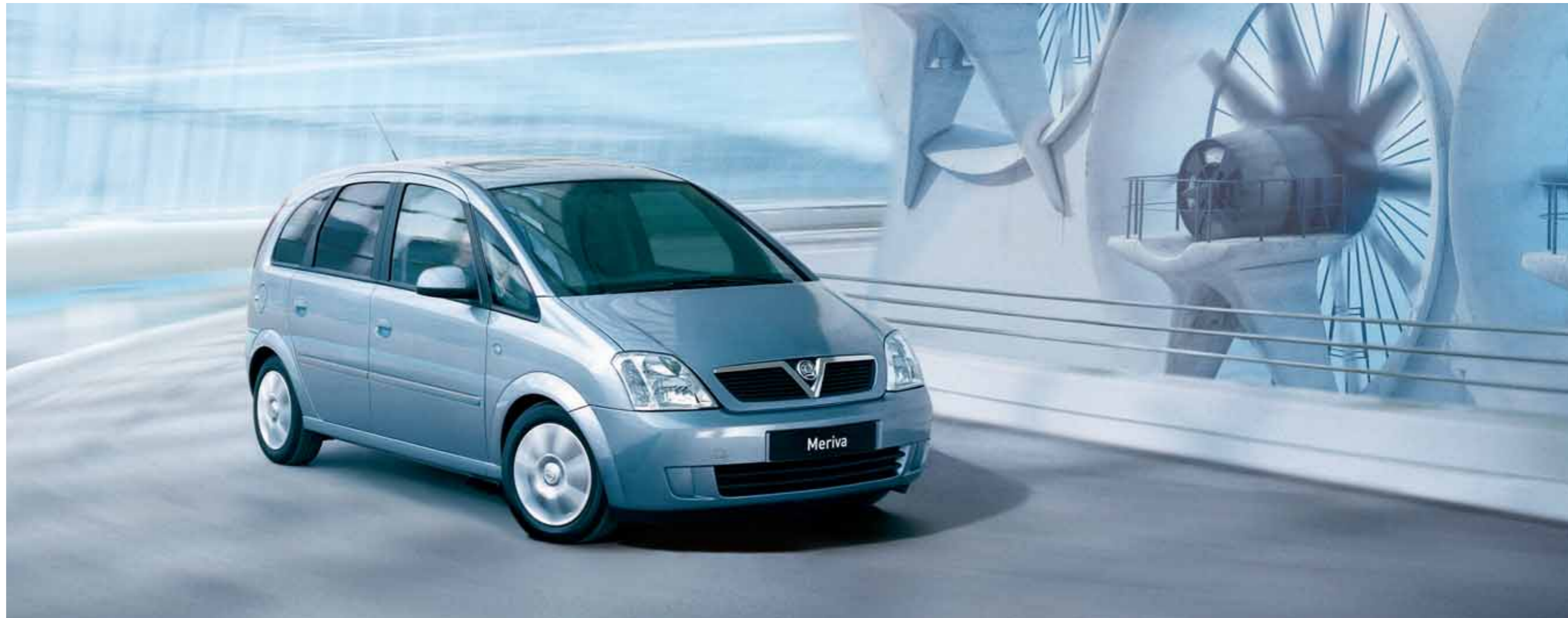
Electrically operated front and rear sunroofs are optional at extra cost.