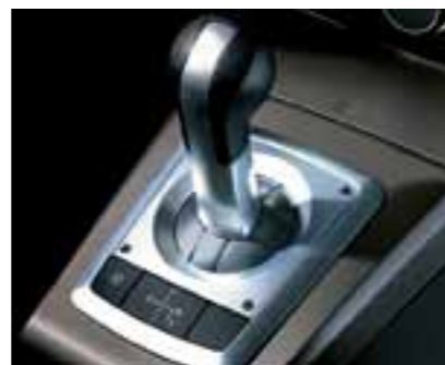
Easytronic transmission (optional).