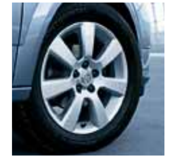
16-inch alloy wheels.