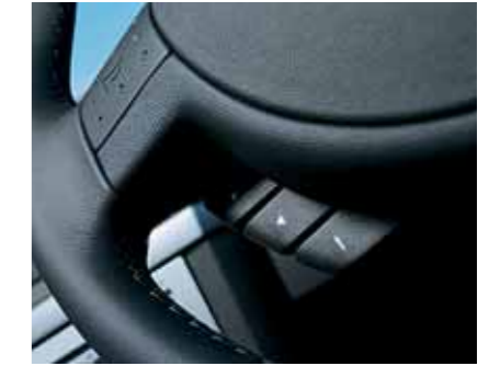
Steering wheel mounted audio controls.