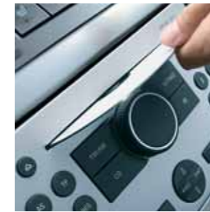
Stereo radio/CD/MP3 CD player.