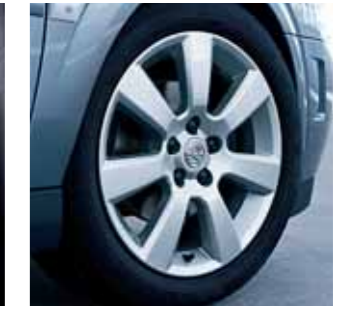
16-inch alloy wheels.