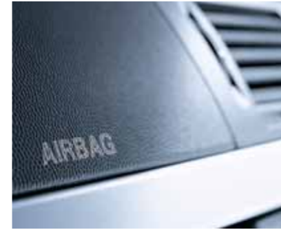
Twin front airbags.