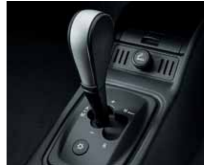
Easytronic transmission (optional).