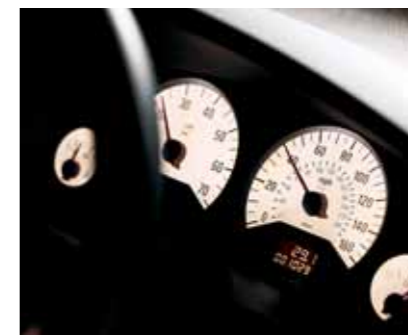
White sports instruments.