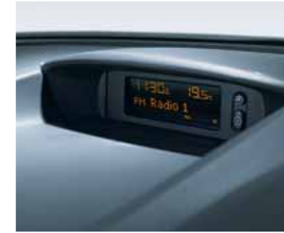
Multi-function display panel.