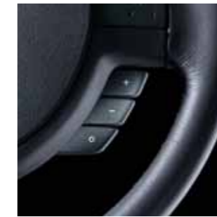
Steering wheel mounted audio controls.