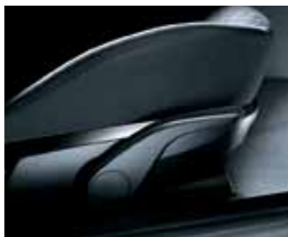
Driver's seat height adjuster.