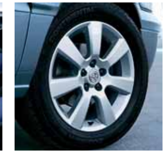
16-inch alloy wheels.