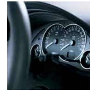
Chrome-effect trim on instrument surrounds.