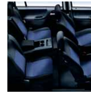
Flex7 Plus seating system.