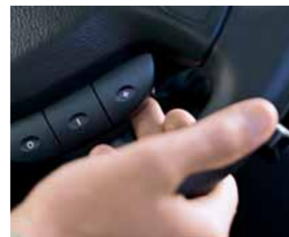
Leather-covered steering wheel with audio controls.