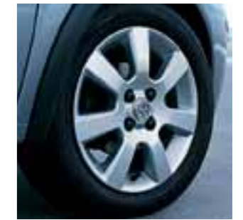
15-inch alloy wheels.