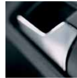
Chrome-effect interior door handles.