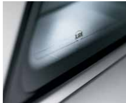
Ultrasonic security alarm system.