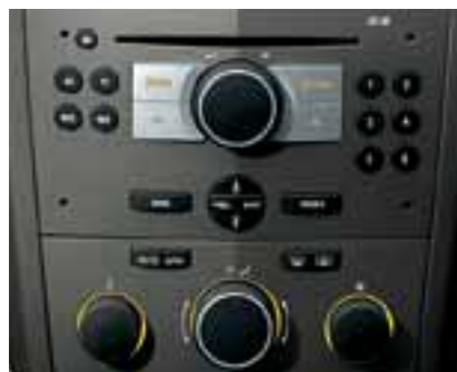
CD 30 stereo radio/CD player.