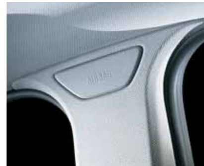
Full-size curtain airbags.