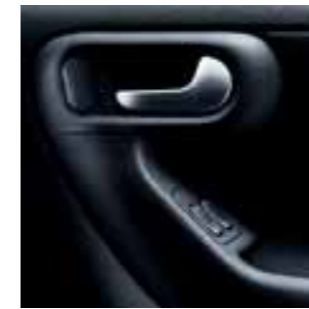
Electrically operated front windows.

The interior benefits from features like air-conditioning and a stereo radio/compact disc player, controlled from the leather-covered steering wheel. And a huge range of options and option packs are available. With three- and five-door models, 1.0i 12v and 1.2i 16v petrol engines and a 1.3CDTi 16v diesel – all available with five-speed manual or Easytronic transmissions – you'll be spoilt for choice.