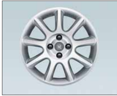
16-inch alloy wheel (part of optional Sport pack one and Street pack).